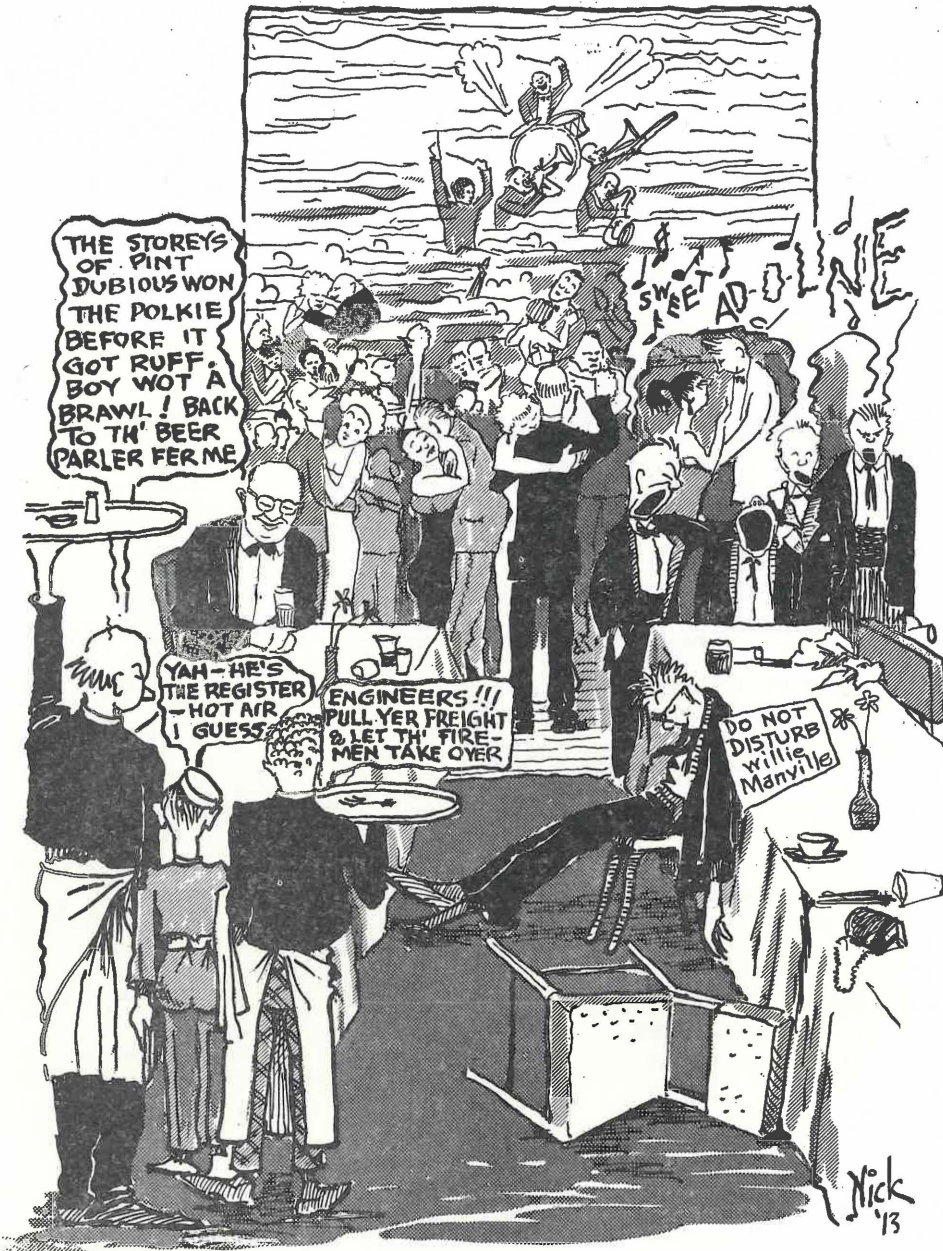
THE ANNUAL "DANCE"