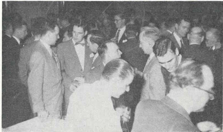
A scene of much activity at the Annual Meeting.