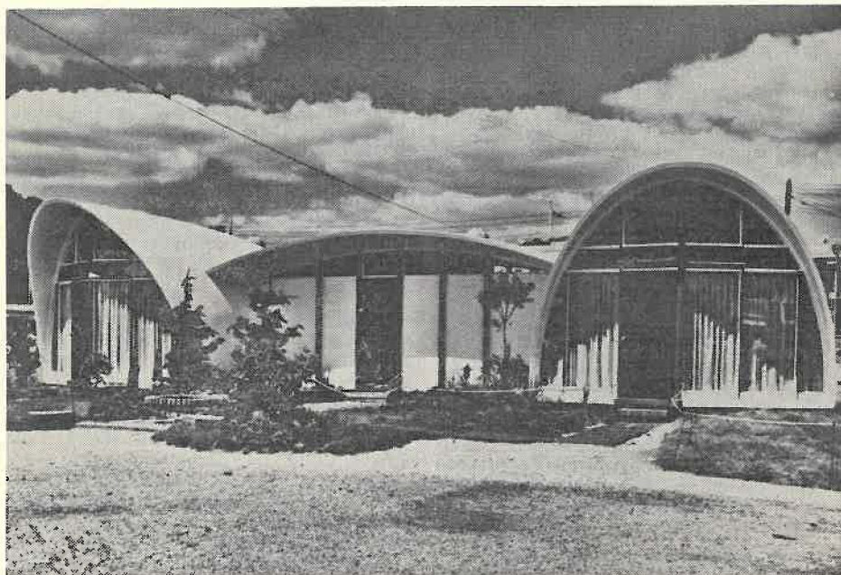
CASSETA, ON EXHIBITION AT THE C.N.E. TORONTO (See Story on Page 6)

Bulletin of the Association of Professional Engineers of the Province of Manitoba